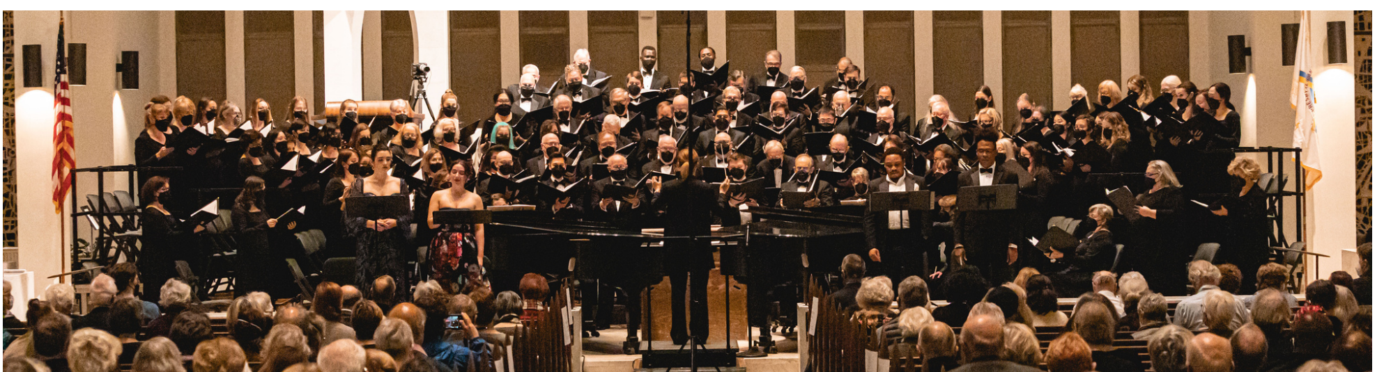
The City Choir of Washington